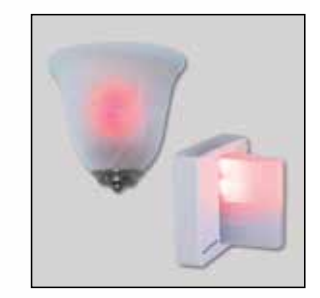
Hallway Indicators: Dome Light and Decorative Sconce Options

As caregivers move throughout the facility, the Pro-Alert 570 pocket page integration routes resident calls directly to caregivers.