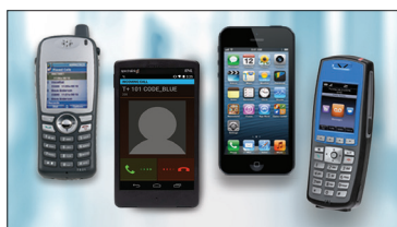
Seamless Integration with the Most Popular Wireless Phones

Provider 700 readily integrates with the most popular SIP (Session Initiated Protocol) in-house wireless phones to route calls directly to the assigned caregiver anywhere throughout the facility. By answering calls directly, caregivers can reassure patients/residents and also save themselves wasted steps by finding out what is needed before going to a room. Wireless phones keep the facility quiet from unnecessary overhead pages as staff can directly communicate with each other. For urgent alerts, such as Code Blue or Staff Emergency caregiver crash teams are instantly notified regardless of their location within the facility.