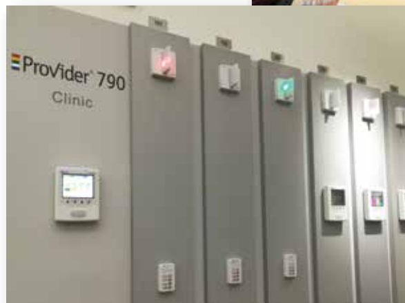
Full Clinic/ASC Operational System

Please scan the QR code to schedule your virtual or in-person visit today!